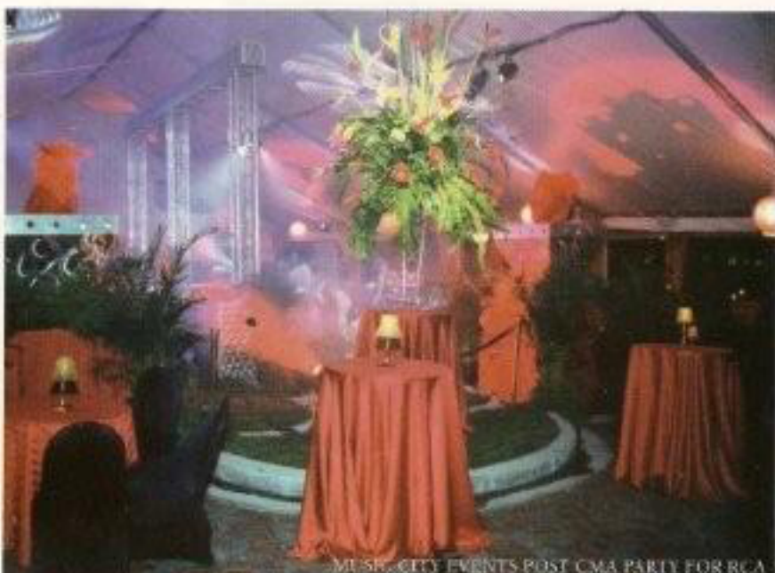
MUSIC CITY EVENTS POST CMA PARTY FOR RCA